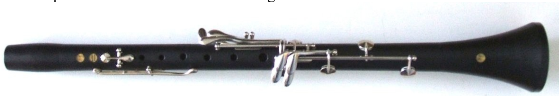
fig. 2: Bohlen-Pierce soprano clarinet by Stephen Fox.

As shown above, the spectra of the clarinet sound differ in the various registers. The characteristics do not change considerably, no matter what kind of clarinet is played. Hence, the same terms for registers can be used for clarinets of any pitch and size, including the Bohlen-Pierce clarinet: The chalumeau register comprises the fingered notes e to b\flat' ; fingered e to a' (sounding d to a\flat' -47ct) on the Bohlen-Pierce clarinet since the fingering of a b\flat' does not produce a note of the Bohlen-Pierce scale. A twelfth above the bottom e , the overblown or clarino register begins, containing fingered b' to c''' . The notes from c\sharp''' upwards are called the altissimo register.